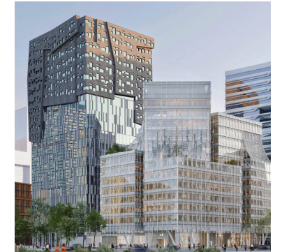
The CubeHouse , delivered 2025 Hybrid timber office Amsterdam